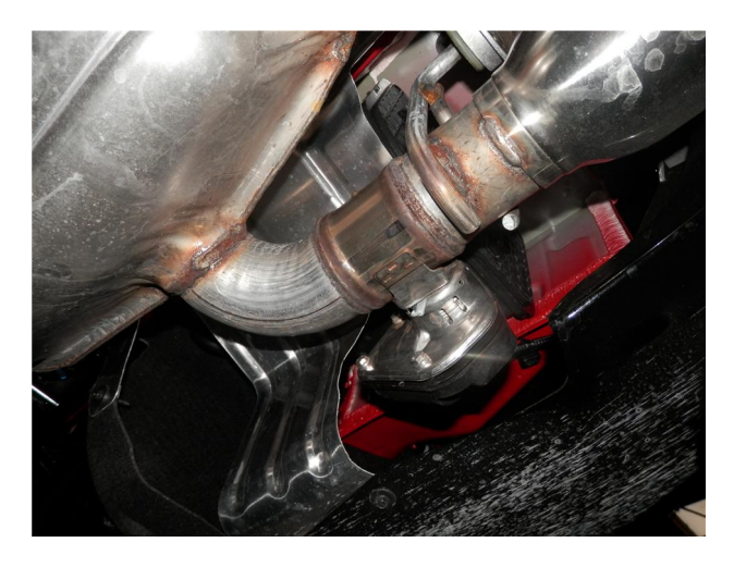
Step 2. Next you will need to unplug the electrical connection on the rear Exhaust Valve Control Motors (Qty 2) located on the OEM exhaust assembly.

Step 1. It is necessary to cut the factory exhaust system to install the new Magnaflow unit. To do this measure 5.75" in front of the welds on the rear muffler inlets. Deburr the cut pipes to facilitate installation of the new system.