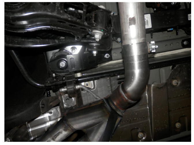
Step 4. Begin installation of the new system by sliding the D/S Tail Pipe Assembly inlet onto the cut outlet of the OEM exhaust and loosely fasten with the supplied 2.75" clamp. Fit the hangers into the rubber insulators.

Step 3. Working front to rear disengage all welded hangers from the rubber insulators and remove the muffler assembly. (Retain the insulators as they will be needed to mount the new MAGNAFLOW system.) Once the OEM system is on the ground transfer both valve motors over to the new Magnaflow exhaust system using the OEM fasteners.